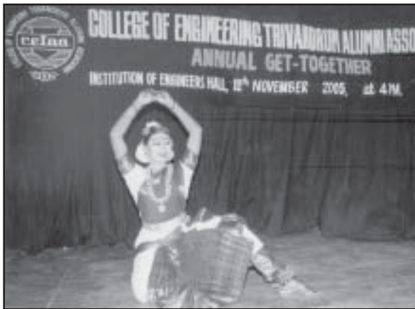
Cultural programme of CETAA Day 2005