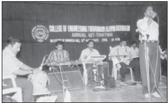
Cultural programme of CETAA Day 2005