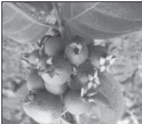
Flora & Fauna from the campus