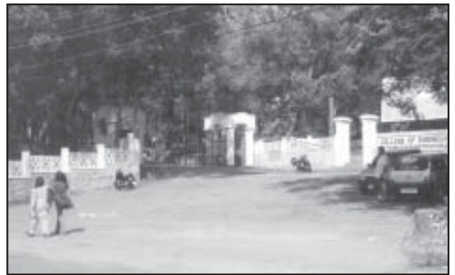
A view of the college at present