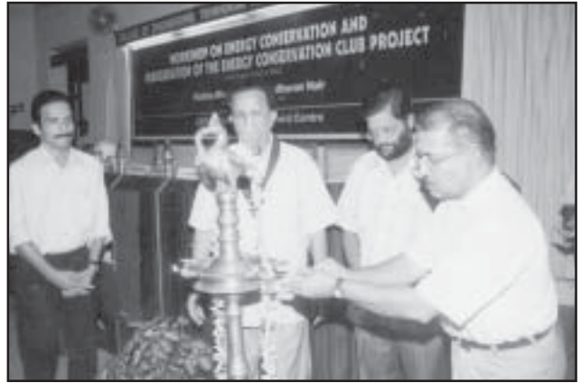
Inauguration of Energy Conservation Club.