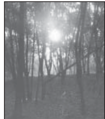
Sunrise viewed from the campus