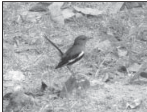
A Magpie Robin (The campus is now home for more than 35 species of birds)